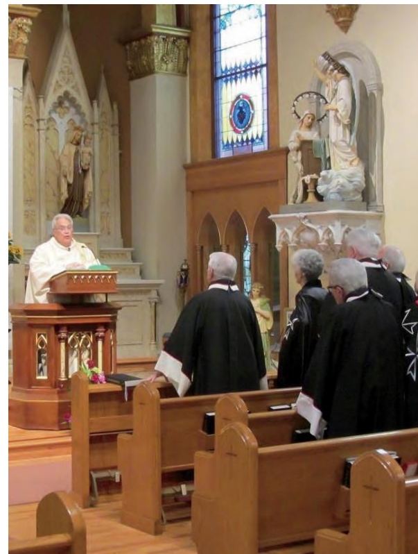
Columbus members celebrate the Feast of St. John, 2011