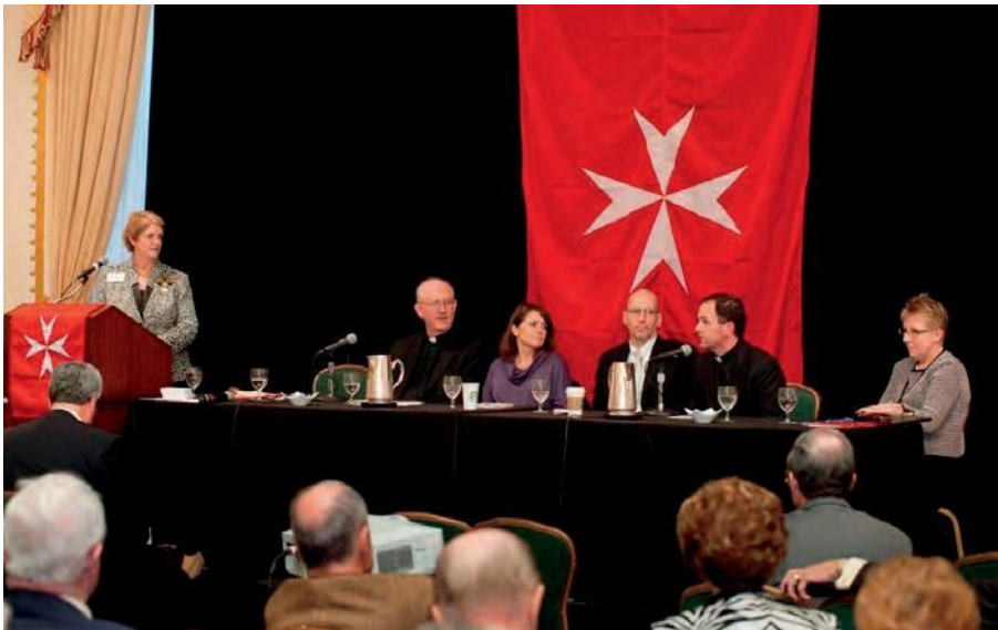
2011 Defense of the Faith Forum