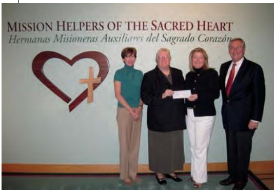
Baltimore members deliver support to the Mission Helpers

Honoring the request of the Grant Master, we have focused our International grants on the Caribbean Basin and Central America. Eight