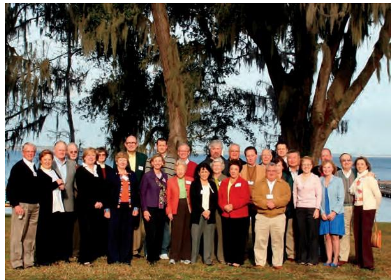
Members and Board at the 2011 Florida Retreat

Bold = New Member of Blessed Gerard Society * = deceased