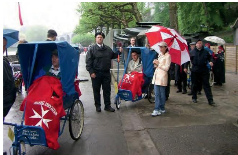
In line for the baths at Lourdes, 2010