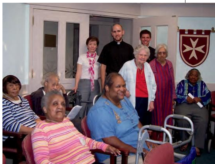
Seminarians visit with Malta House, MD residents