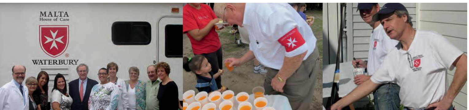
Hartford's "Day One" with the new medical van