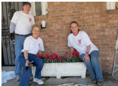
Members rebuild and renew New Orleans

...Be it mine to practice charity towards my neighbors, especially the poor and the sick.