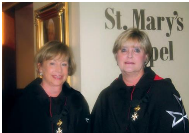
Atlanta members at the Mass of the Feast of St. John the Baptist, 2010