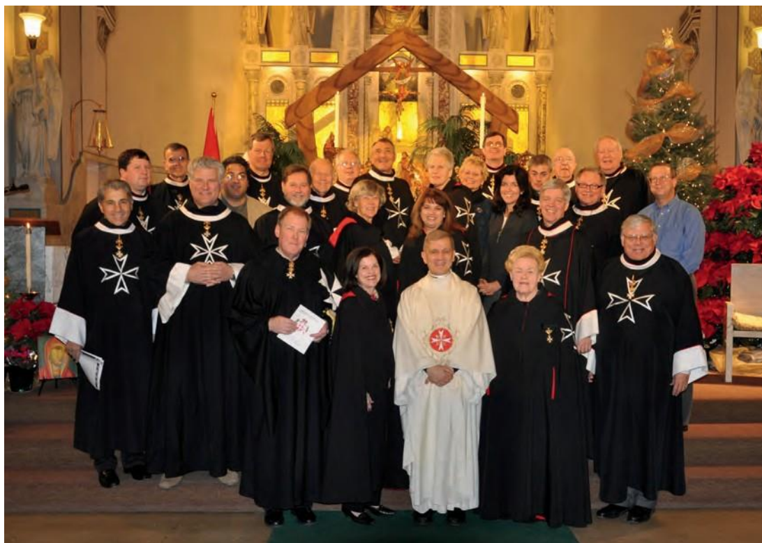
Chicago members at the Day of Reflection