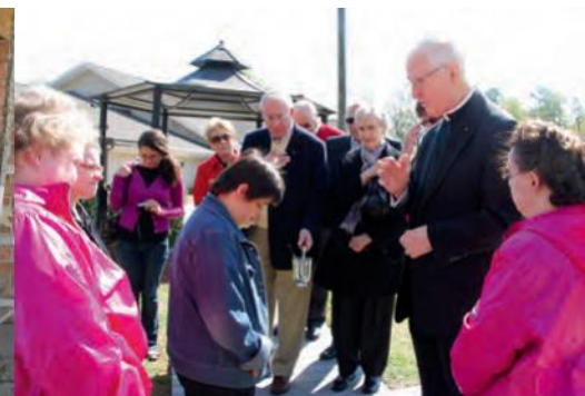
Charlotte members at the Holy Angels Foundation

on service to the poor. Each region has a need for members to serve on committees, help organize local events, participate in work projects and to seek opportunities for members to work in community serving the sick and the poor. Contact your regional hospitaller and offer to help!