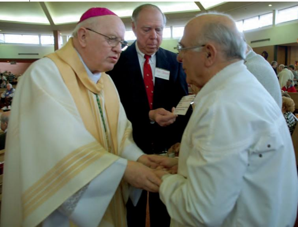
Kansas City Mass of Anointing, 2010