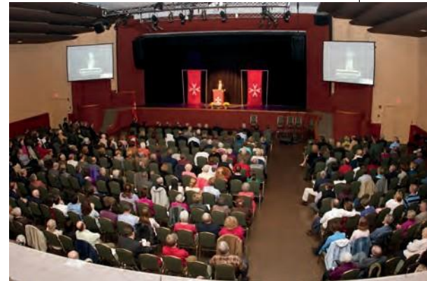
Lancaster, PA Defense of the Faith Forum with speaker George Weigel

While the committee ordinarily limits grants to $10,000 or less, in 2011 an urgent request by the U.S. Conference of Catholic Bishops to all three U.S. associations of the Order