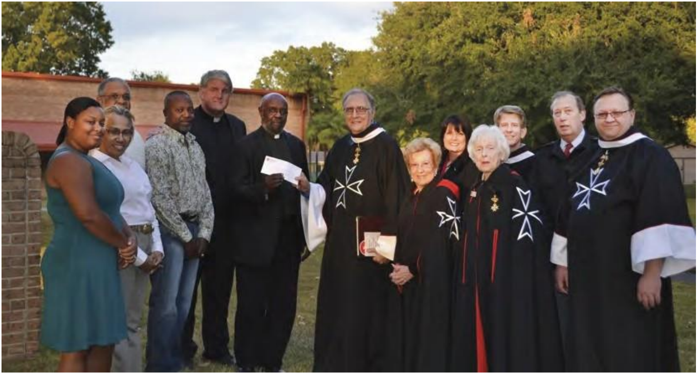
Lafayette, LA members deliver a Federal Association Grant to the Pastor of Our Lady Queen of Peace Church

D espite continued weakness in both the U.S. economy and financial markets, the Federal Association ended 2011 in sound financial condition. A record number of our members supported our grants program by contributing $836,627 to the Annual Appeal, an increase of nearly 7% over the 2010 total. This year's average gift of over $1,300 is in line with the levels of previous years. Thus, we are making progress toward but are still well short of achieving 100% participation. The Annual Appeal is the primary funding mechanism for the Grants Program which focuses our support of the many worthy projects around the Federal Association's geographic footprint. Please continue to make this a priority in your charitable giving.