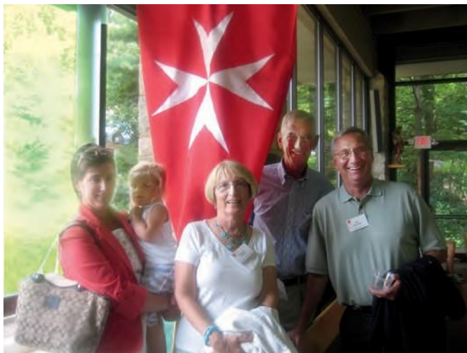
Members at the Lourdes Reunion, 2010 at Mt. St. Mary's University